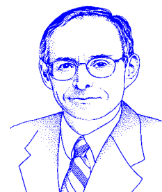
Harold Klemp The Spiritual Leader of Eckankar

To have this newsletter sent to your email address, please call 503-362-2695.